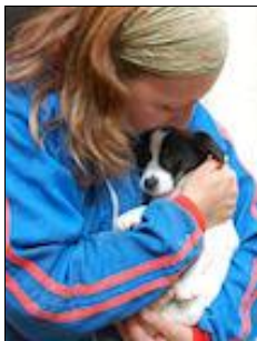
Espe ( Cehegin)