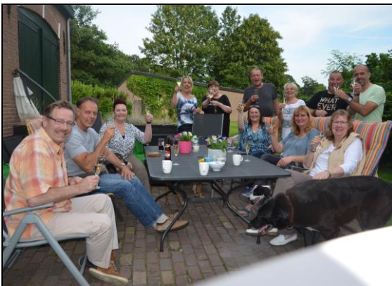
Teambuilding, september 2016