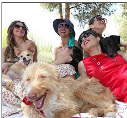
Het team van het asiel in Villena